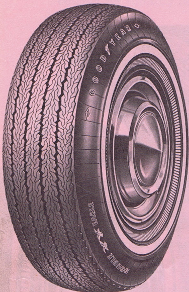
3T VYTACORD DOUBLE EAGLE

DOUBLE EAGLE "N" * With LIFEGUARD Safety Spare* (Combination Price and Tax)